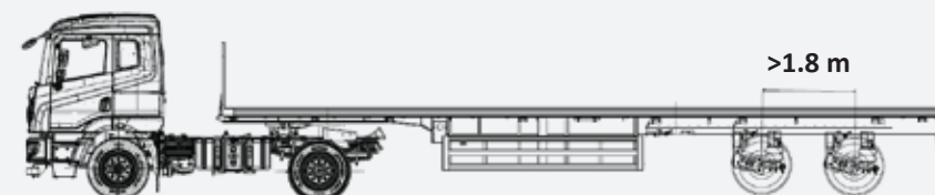
4425 - with pneumatic suspension in trailer