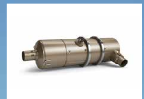
Advanced EATS (Engine After Treatment System)