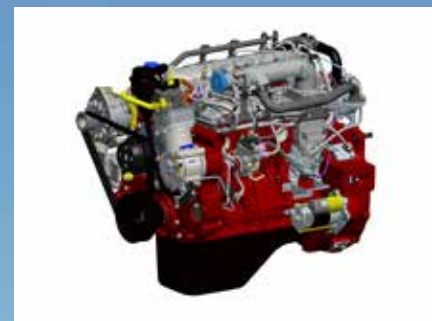
H4 - 110 kW (150 HP), 450 Nm fuel efficient engine