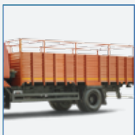
Class leading payload across variant