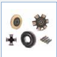
Heavy duty and reliable aggregates