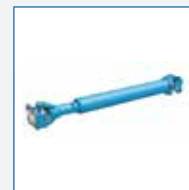
Lube for life propeller shaft