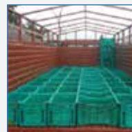
Wide load body