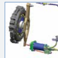
Unilever clutch actuation system for lower effort and high reliability