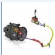
Cable shift CSO for reduced gearshift efforts